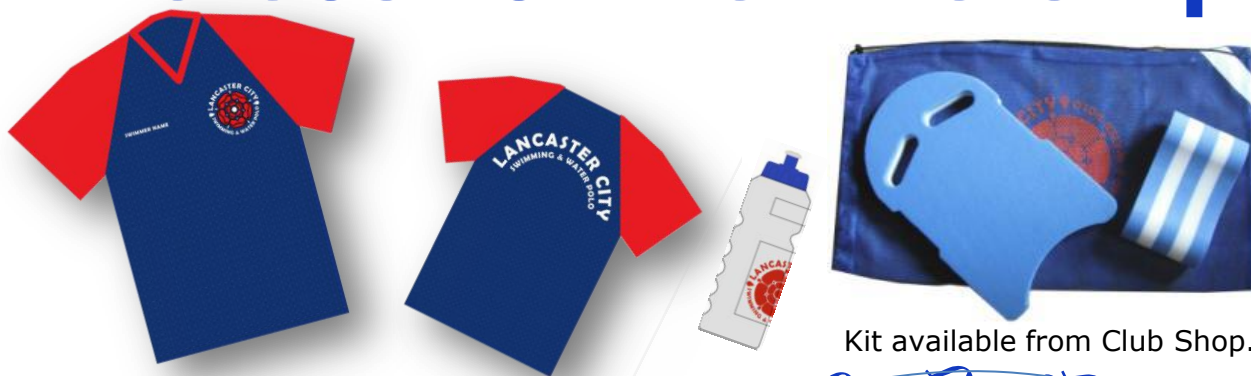
Kit available from Club Shop.